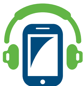
FIGURE 1 Everyone Is Listening to Podcasts

40% of Americans have listened to at least one podcast